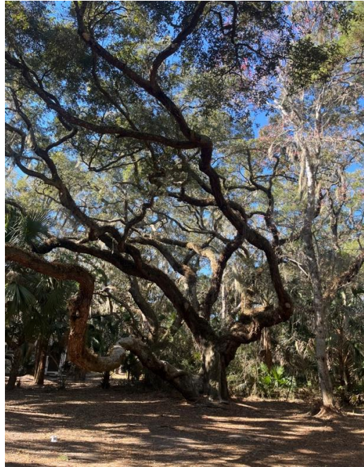
Landmark Oak. Estimated 500 years old+. Omni Amelia Island resort

I had a short jaunt to Northeastern Florida, specifically Amelia Island, in late February. I went with my Mom and we visited her only living brother. He is a non-birder, though he sees many birds when he is participating in his favorite activity - golf. We ended up watching the YouTube sensation, Listers: A Glimpse Into Extreme Birdwatching and by the end of our four-day visit he was flipping through my guide book, asking questions and went out on a short excursion with us. It reinforced in me the power of Nature.