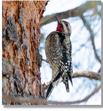
Yellow-bellied Sapsucker, Mountain View Cemetery in Longmont, 2-27-26