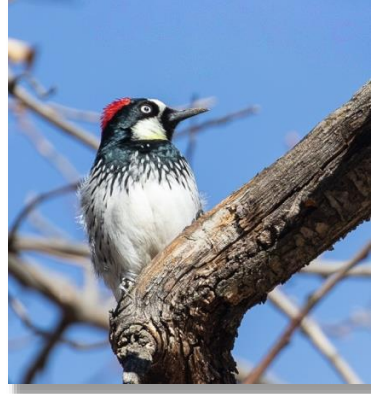
Acorn Woodpecker (f), Mountain View Cemetery in Longmont, 2-27-26