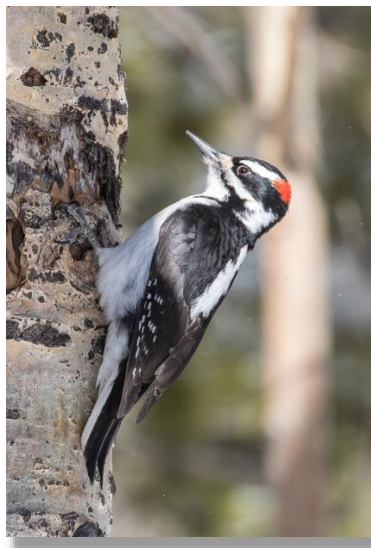
Hairy Woodpecker, Allenspark, 2-14-26