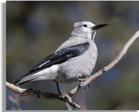
Clark's Nutcracker, Allenspark, 3-14-26