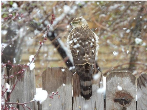
Juvenile Cooper's Hawk