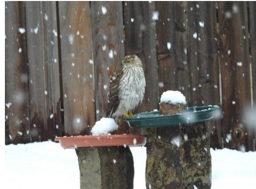
Juvenile Cooper's Hawk