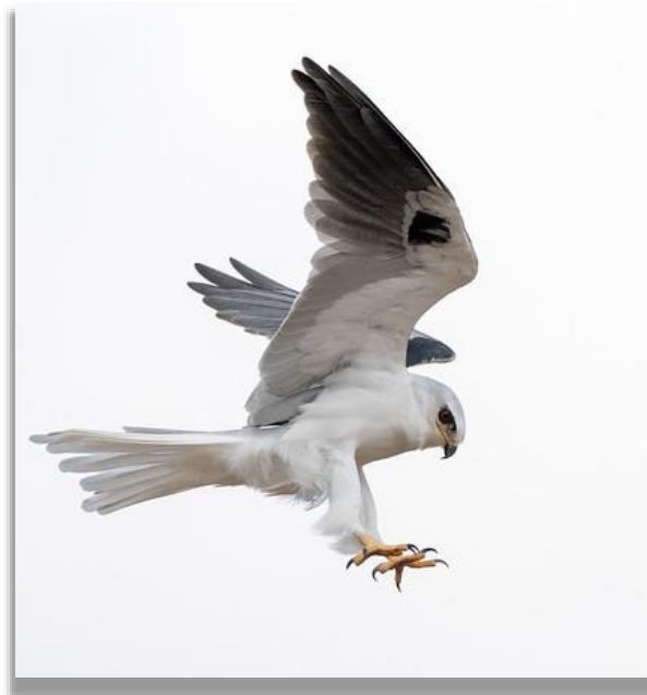
White-tailed Kite, Rio Grand Valley, Texas

Rio Grande Valley, Texas January 28 - February 8 Kevin Rutherford