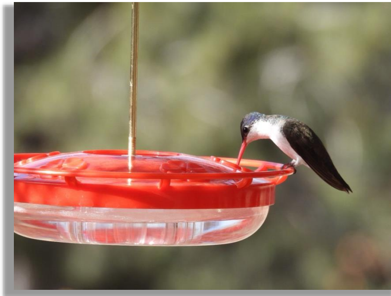
Violet Crowned Hummingbird