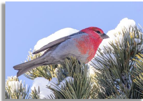
Pine Grosbeak, Ward, 2-14-26